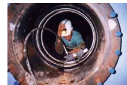
Expand Band with Expander