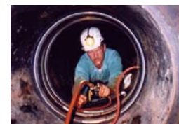
Pressure Test Seal