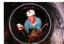
Check for Leaks.