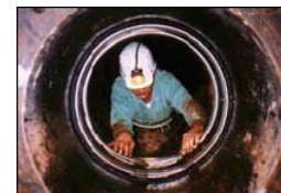
Install Retaining Bands